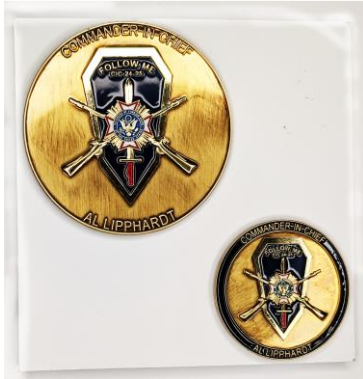
Commander-in-Chief Medallion and Coin

Below you will see examples of some of the awards and items mentioned in this program. For more information, contact the VFW Membership Department.