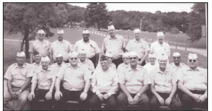
Don't forget OTI if you want to learn more about rules and regulations.

You indicate in your letter that you have made a request to examine the Post Quartermaster's books, but that it has fallen on deaf ears. It is suggested that at your next regular Post meeting, you make a motion and have it