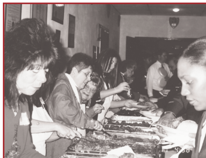
Post #3211 — Hicksville — Wives and family members serve the soldiers and their families of the 800th Military Police Brigade.