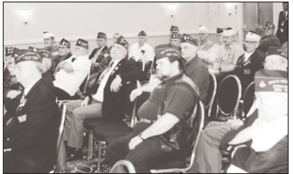
Membership in attendance at one of the many Committee meetings.