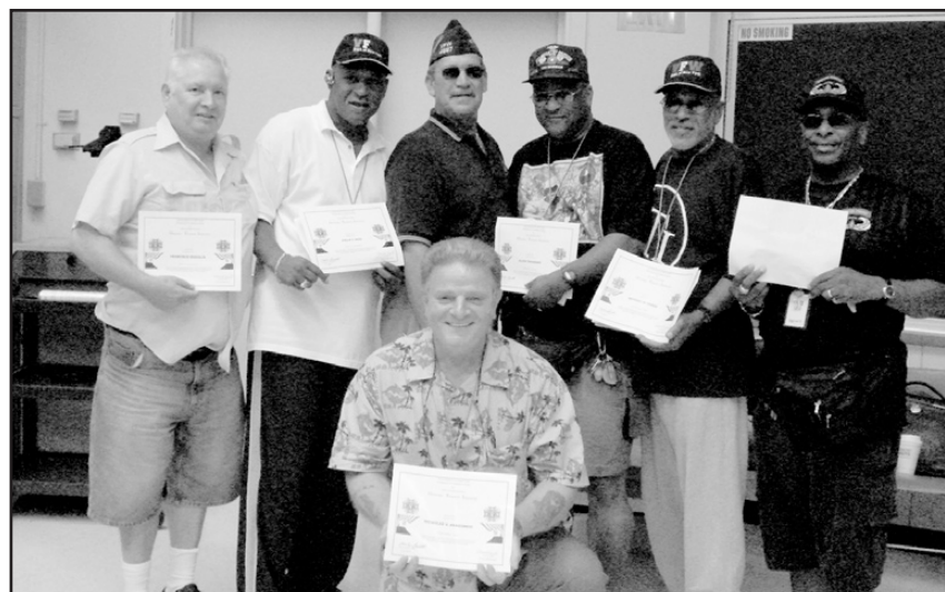
Members of Post 3083 with State Commander.