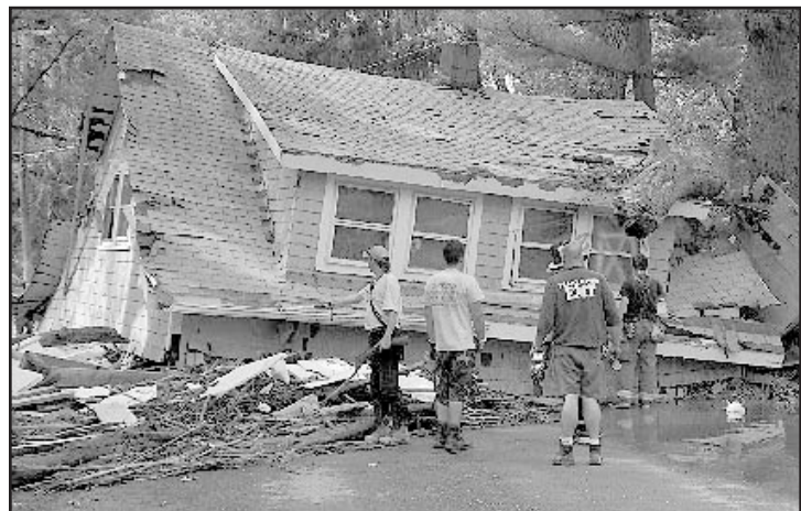
These photos of the flood of '06 are taken in Conklin, NY. The Susquehanna River, filled with all kinds of nasty and vile contaminants, overflowed its banks and blew four houses off their foundations from gas leaks. This house floated down river about half a mile and landed on Alta Road. The rescue people in this photo were able to approach this area after floodwaters had subsided.

Submitted by Commander Wayne Felsheim, Johnson City