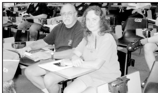
OTI was a good learning experience for all veterans, note the smiles and, of course, the USMC insignia.