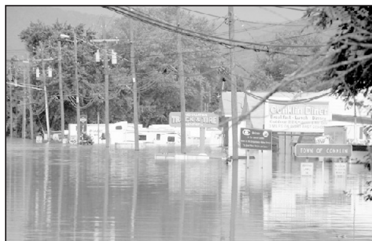
The trailer park is located across from Johnson Camping/Eureka Tent and Awning. Not shown in the photo is Eureka Tent and Awning, which has floodwater up to the top of their showroom windows. Today, a month after the flooding, Conklin is continuing to clean up the debris. Driving along route 7 still gives you a sick feeling when you see mile after mile of homes and business still damaged or cleaned out from the flooding.