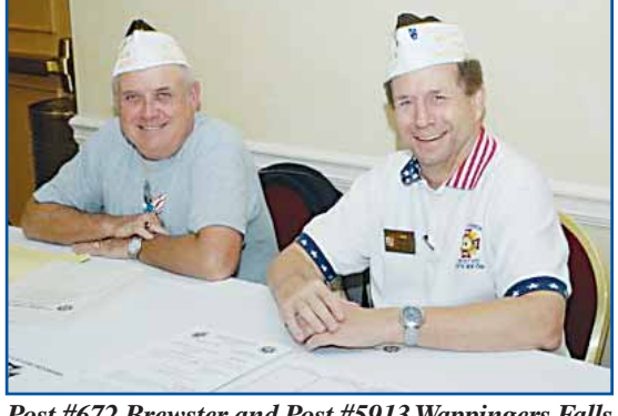
Post #672 Brewster and Post #5913 Wappingers Falls are well represented, and they enjoy their work.