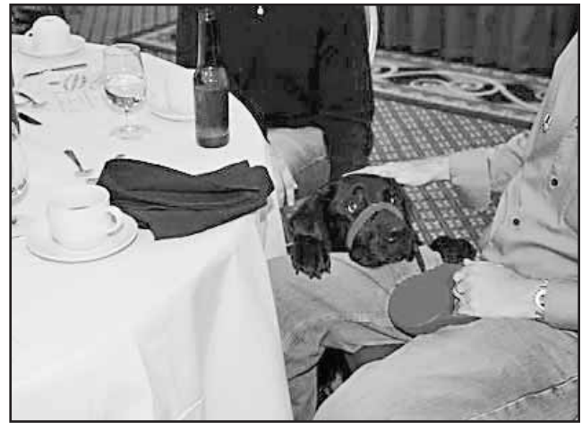
Check out the loving dog loving his vet!

NEADS' dogs serve as Walker Dogs when the veterans are ambulatory and walking with their prosthetics. They provide balance when walking, going up and