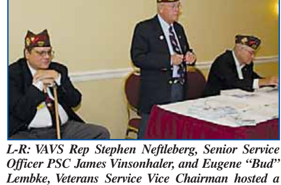
Service Officer/VAVS class at the Fall Conference.