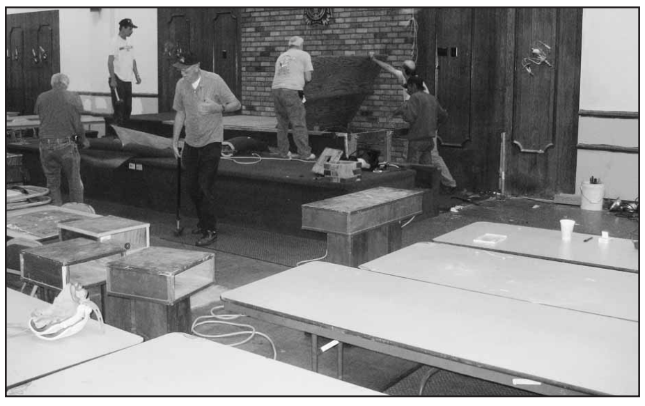
Taking the old stage apart.

Commander Dennis Sullivan Post #4927 Centereach would like to render a PERSON-AL THANKS to all the members and Auxiliary that helped with the renovations.