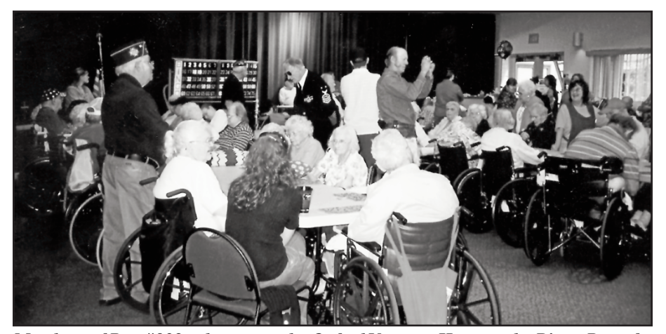
Members of Post #932 volunteer at the Oxford Veterans Home at the Bingo Party for residents. The Post also contributes $25.00 in half-dollar coins, which are used as Bingo prizes; and community ladies make lap robes, which are also used as prizes.