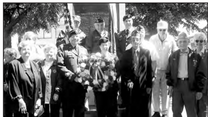
On Sunday, May 25, 2008 VFW members and their families from the Rankin-Healey VFW Post 4785 gather at the Fort Hamilton Triangle Park where they laid a wreath at the World War I Memorial.

"Our voices – united toward a common cause – urged America's leaders to reward the gift of education to the men and women who protect our great country," he said. "This is why the VFW is just as relevant today as we were 109 years ago when we were founded. We make a difference."