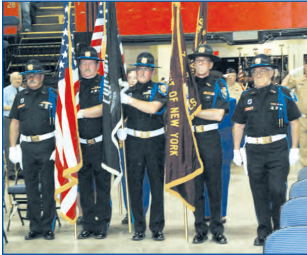
Joint Opening Ceremony – State Color Guard, Rome Post 2246.