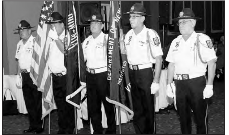
The State Color Guard stand waiting and ready to advance the Colors at the testimonial dinner of the Department Convention held in Binghampton during June. The State Color Guard are members of VFW Post 2246 located in Rome, New York.