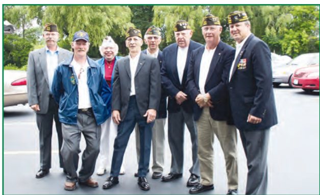
Post 1545 members recently participated in a dedication of a WWII Memorial in Coxsackie, NY.