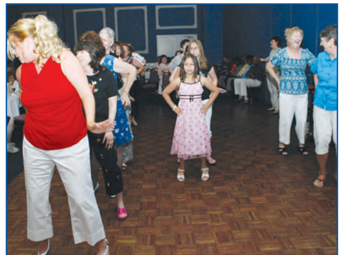
Line up to do the electric slide at the Commander and President's reception Saturday evening.