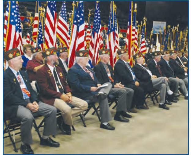
Joint Opening Ceremony – Participating with their colors are the District Officers, County Councils and Posts.