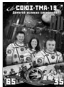
Right: The publicity poster for the launch! The 65 represents the number of years past since U.S. and Soviet (Russian) forces linked up in Germany at the end of WWII and the 35 represents the link-up of the Soyuz and Apollo ships 35 years ago.