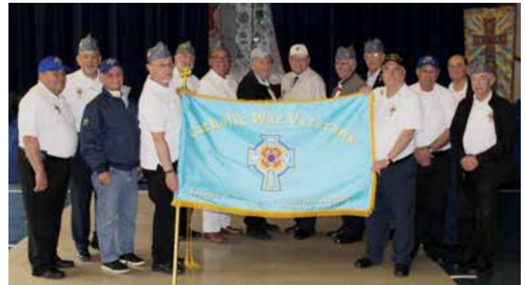
CWV Post #386 members proudly display their new flag dedicating their new designation as the Joseph R. Farina Memorial Post #386.