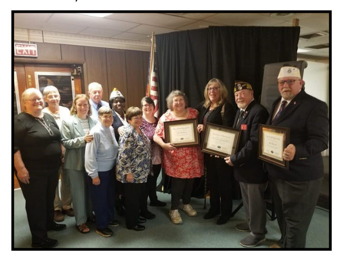
Post 7227 along with Carthage Area Chamber of Commerce members pose for an Award photo.

you! The award was given at the Chamber Dinner October 19, 2021.