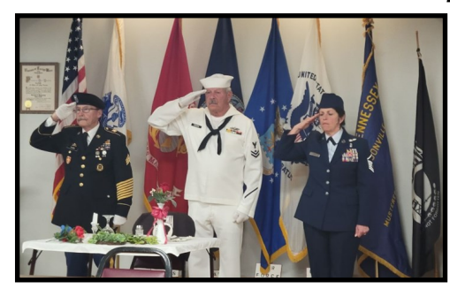
Retired service members at District 4 POW/ MIA Ceremony