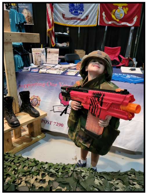
Young fair-goer enjoying the VFW booth at the New York State Fair in Syracuse