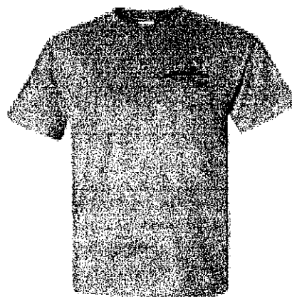
Gildan Ultra Cotton T-shirt Sport Gray sizes: M– 4XL 90% cotton/10% polyester $20.00 each